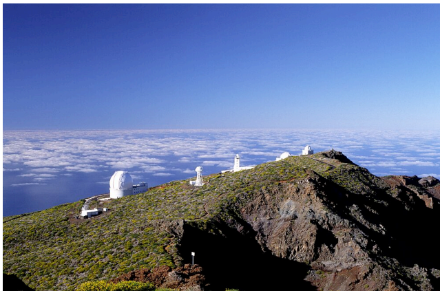
Figure 2 Clear blue sky above La Palma.